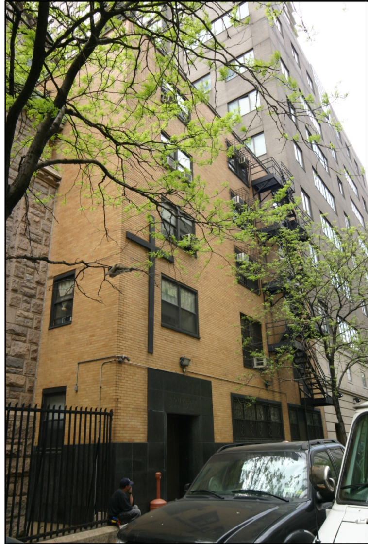
Church of St. Paul the Apostle Left: south facade, from 59 th Street Right: 120 West 60 th Street