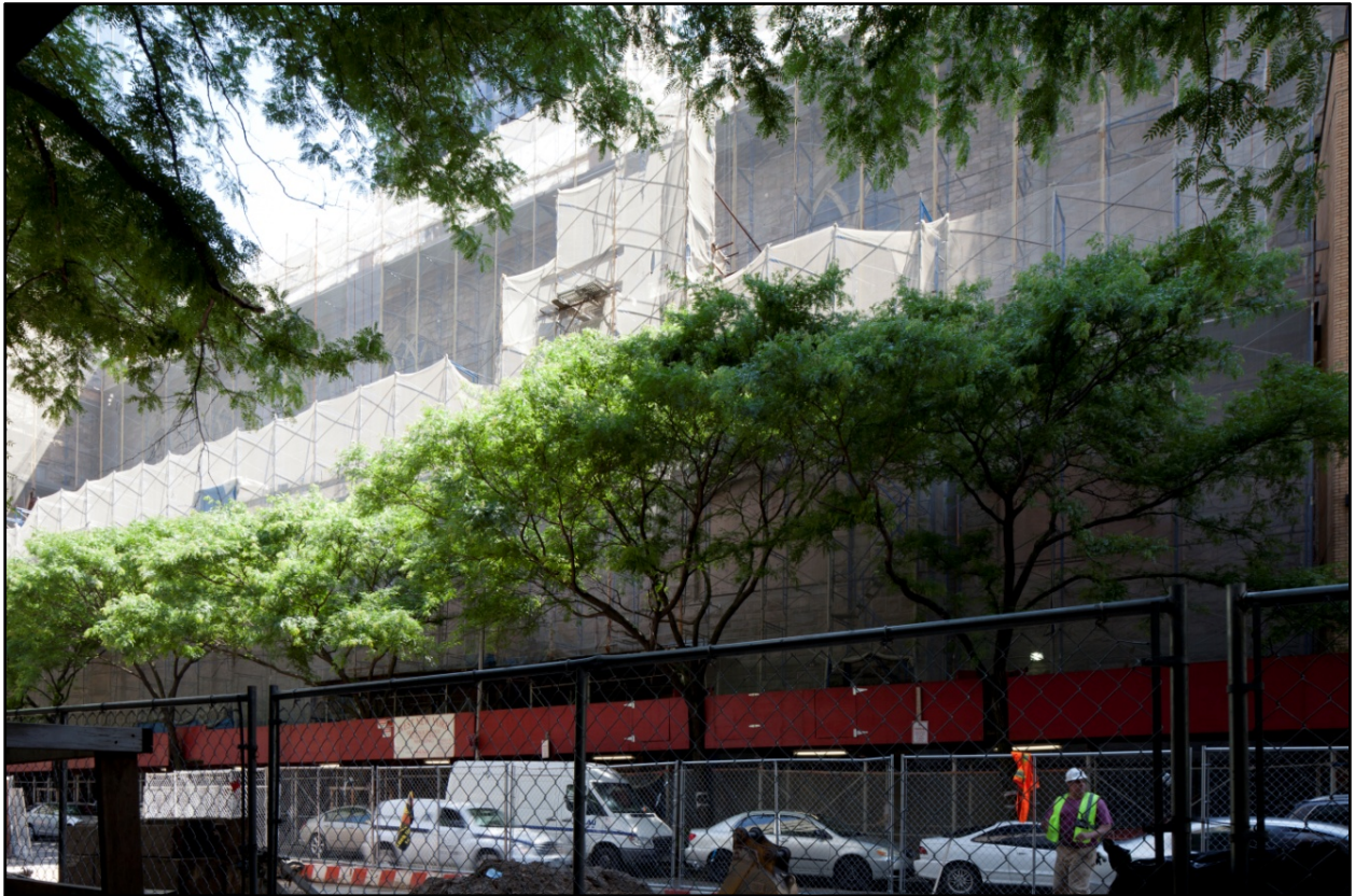
Church of St. Paul the Apostle Views of West 60 th Street Upper: Carl Forster, 2007; Lower: Christopher D. Brazee, 2013