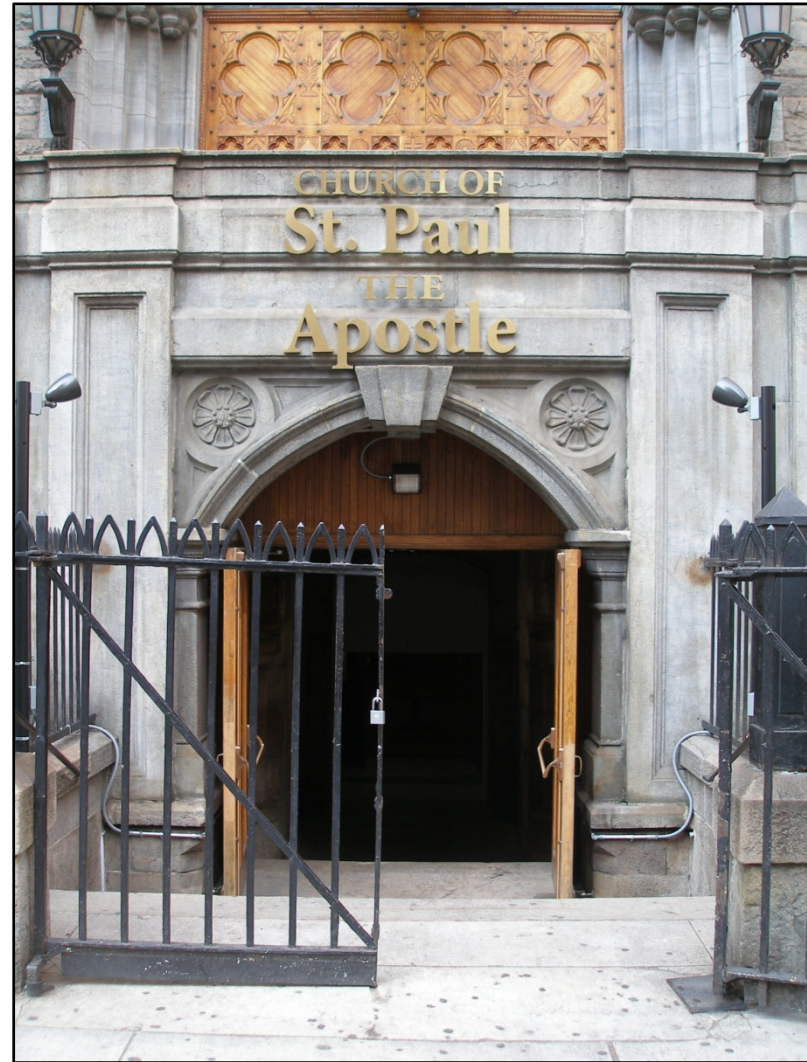
Church of St. Paul the Apostle Columbus Avenue facade Main (center) entrance, entrance to lower level