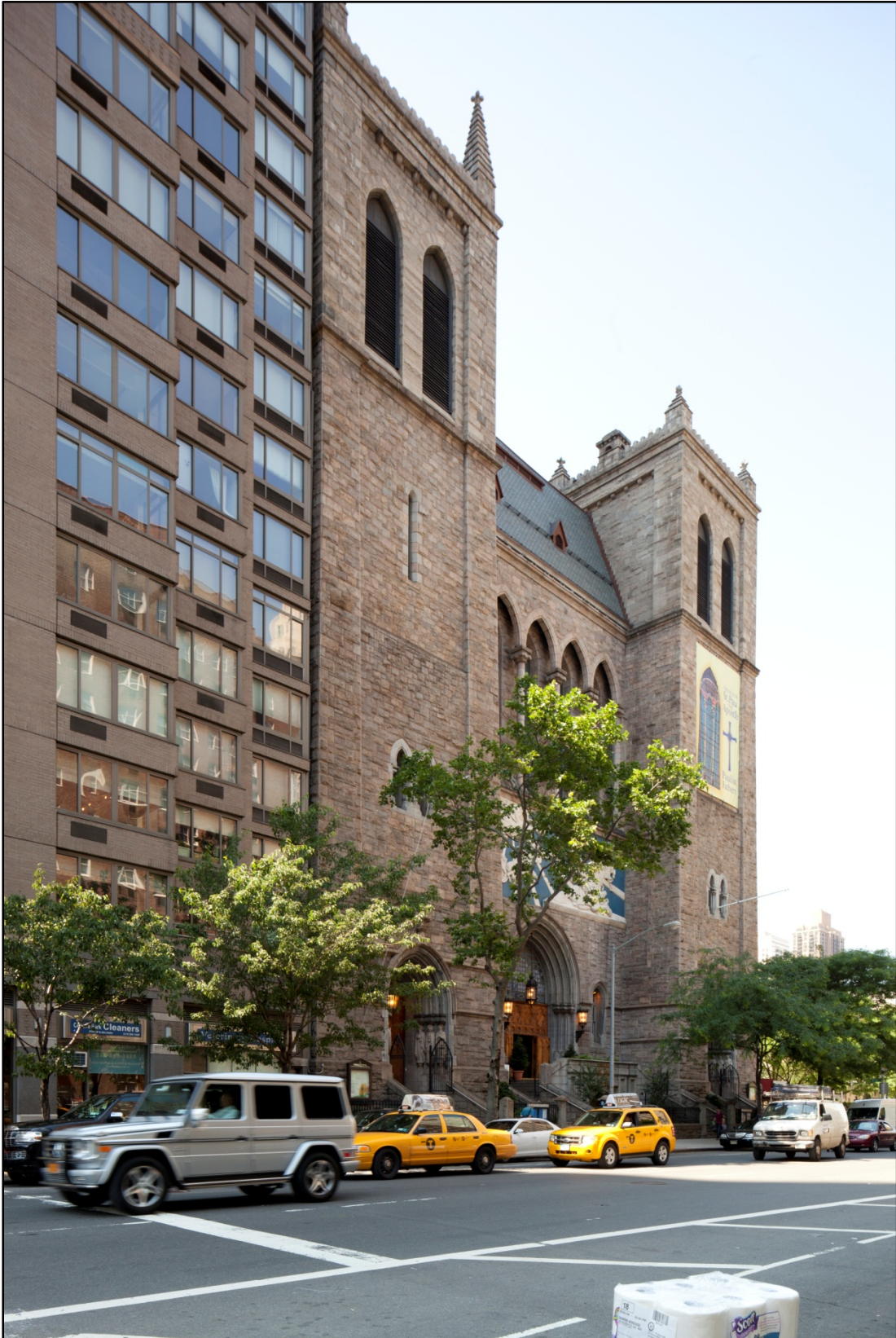
Church of St. Paul the Apostle Columbus Avenue facade